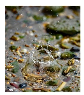
Aquadome Accepted Malcolm Wade