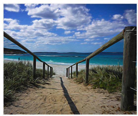
Short Beach walkway Commended Lyn Hamilton