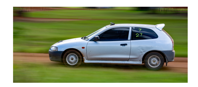
7-27 Commended Malcolm Wade