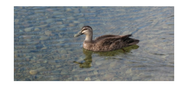
Searching Accepted Ian Moncrieff