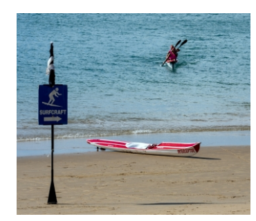
Interceptor Accepted Malcolm Wade