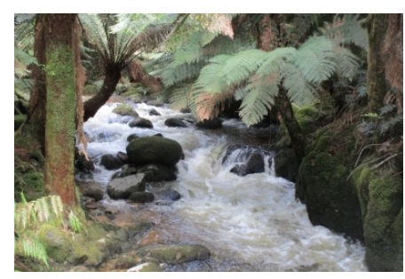
Tassie stream Accepted Ian Moncrieff