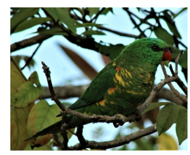
Scally breasted loikeet Accepted David Deem