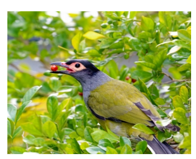
Figbird Accepted Jane Clarke