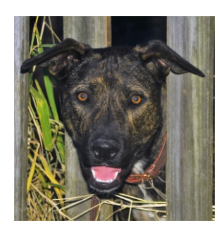
A DOG LOOKING v2 Accepted