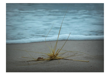
On the Beach Accepted Lyn Hamilton