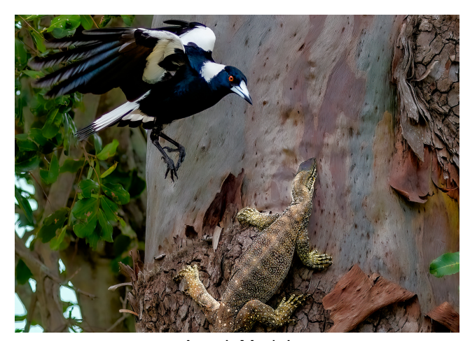
Attack Mode! Highly Commended Phillip Keath LAPS AAPS