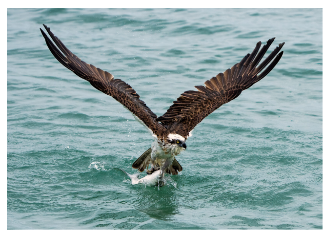
A good catch Highly Commended Malcolm Wade