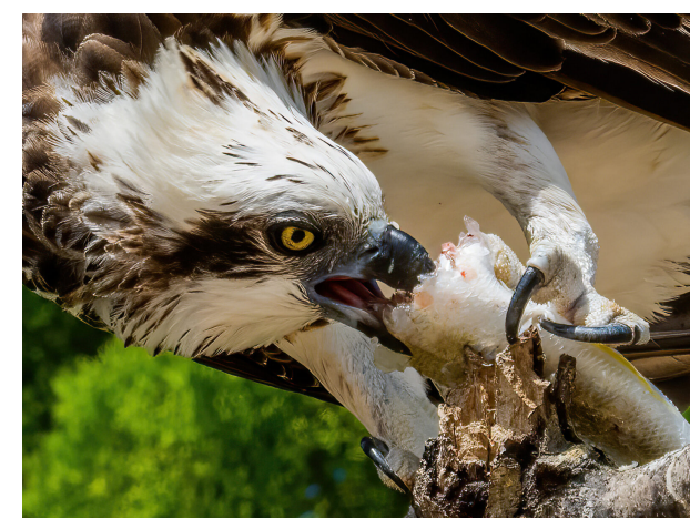
Lunch Highly Commended Malcolm Wade