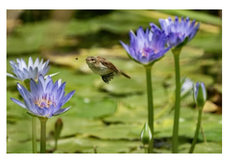
Beeline Accepted Malcolm Wade