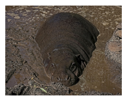
Pigmy Hippo Accepted Lyn Hamilton