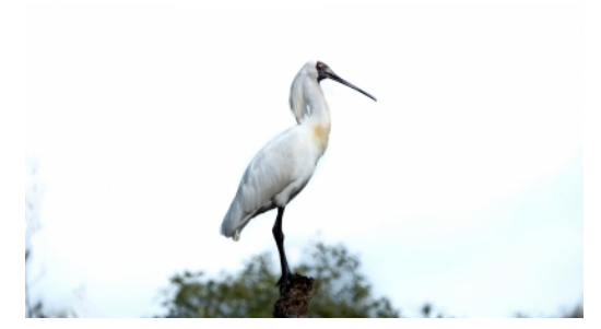
Royal Spoonbill Accepted Carlos Taborda