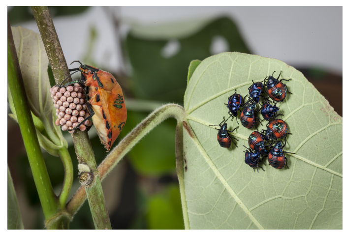
The Harlequin Beetle mother eggs an