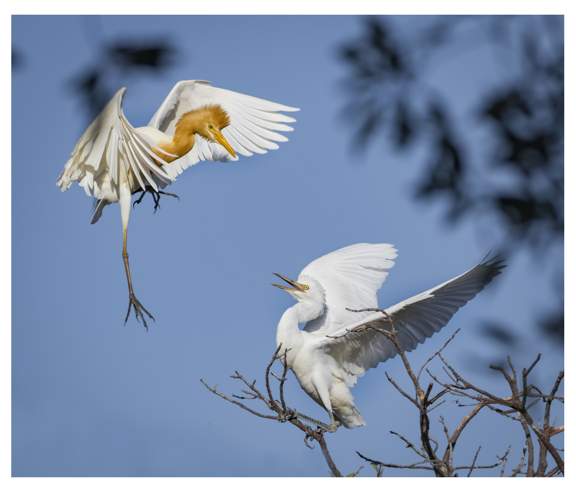
Egrets Cattle Hi Mum Honour