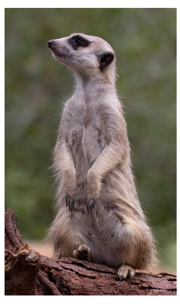
Meerkat Lookout Merit Deborah Sypher