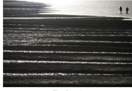
The Beach Accepted Helene Walker