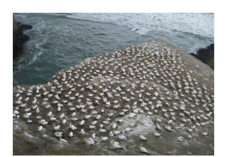
LOOKING FOR ROOM Accepted Ian Moncrieff