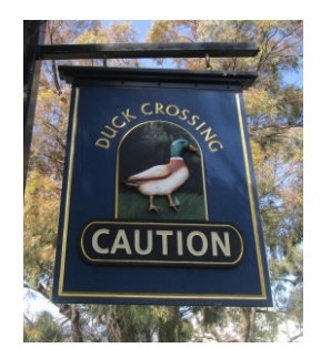
Duck Workplace Health and Safety Accepted lan Moncrieff